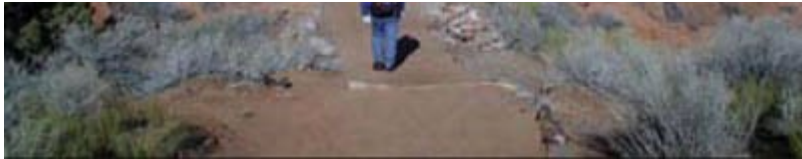
A hiker makes his way among the rock fins to Landscape Arch.

This hike takes you near five spectacular arches. As you make your way among the rock fins, the trail is graveled and well-maintained. You arrive at Landscape Arch at 0.9 mi. After the arch, the trail becomes more challenging as you follow cairns and cross over slickrock. Wall Arch hugs the trail as you enjoy the shade in this narrow area. The trail opens with cairns leading the way to the Navajo and Partition Arch junction. You come to the junction at 1.3 miles into the hike. This easy side trip is well worth the time to see these beautiful arches. As you continue on the main trail, you come to a sign directing you to Double O Arch. From here, the trail goes to the top of a rock fin with dangerous drop-offs on both sides. After the rock fin, you come to Double O Arch. Take time to explore more of Arches National Park and remember to bring plenty of water for your adventure. Parents with small children should only visit Landscape Arch on this hike, because of the challenging terrain beyond it.